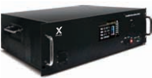
• Lithium Battery