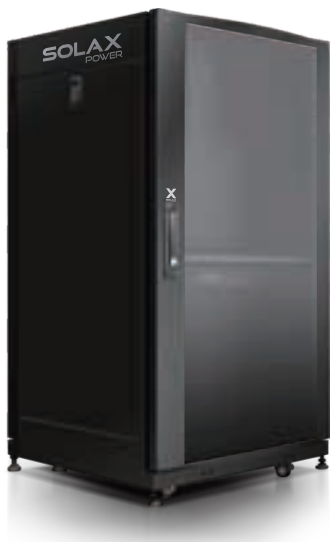
• Lithium Battery Cabinet